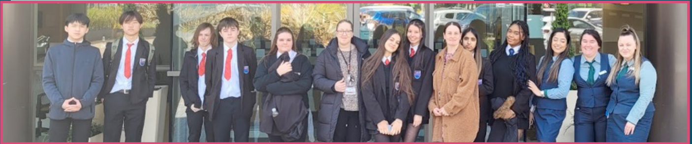
HOLIDAY INN MEDIA CITY Hosted a visit from The Oasis Academy.