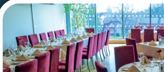
Aspire Restaurant & Bar